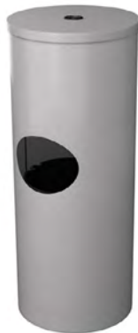
109522 *Includes Hanging Bracket for Larger Rolls of Wipes

Wipes and Waste in one convenient container. The Cleanli™ is designed to complement any space while providing the perfect solution to dispense sanitizing wipes and collect waste. The unit will support the dispensing of hardshell or large roll wipes, with a finish that resists corrosion due to the sanitizing fluid. It's smart, ergonomic design means that the unit is easy to service, with the handle on the waste container always standing up, keeping employees away from contaminated waste.