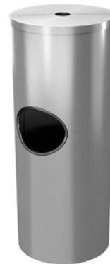
109258 *Includes Hanging Bracket for Larger Rolls of Wipes