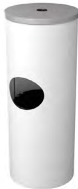
109524 *Includes Hanging Bracket for Larger Rolls of Wipes