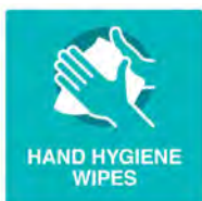
HAND HYGIENE WIPES

To clearly indicate the type of sanitizing wipes within the GO Series container, these stock label options are available. All labels are able to be customized.