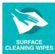
SURFACE CLEANING WIPES

NOTE: Because different computers, monitors, and printers render colors and textures differently, actual finishes may vary from those shown here.