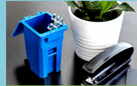
Mini Roll-Out Recycling Cart